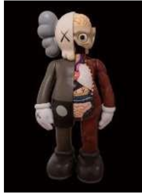
Companion dissected brown

KAWS's career started subverting bus shelter adverts displayed around NYC, adding his own characters to the slick promotional posters. Rather than removing the advert, KAWS chooses to associate his characters with the brands being advertised. The irony being that now, the characters he created are considered more fondly than the brands that he defaced.