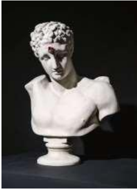
Bullet Hole Bust

"Bullet Hole Bust" is an example of Banksy's sculptural artwork. The piece hails from Banksy's seminal exhibition "Barely Legal" in 2006, that catapulted the artist even further into the international consciousness. A subversive reworking of the age-old practice of sculptural busts, Banksy takes aim at the classical cannon with the addition of a bullet hole in the centre of the subject's forehead."