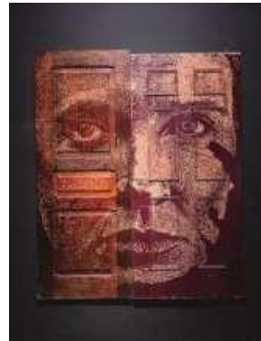
Dispersal Series #14

One of Vhils' representative works set in an urban space, it makes full use of the "scratch" technique, in which explosives and other materials are used on the surface of the wall to create the work by scraping away the surface layer. The theme of the work is the social changes that occur as a result of people's mobility and urbanization.