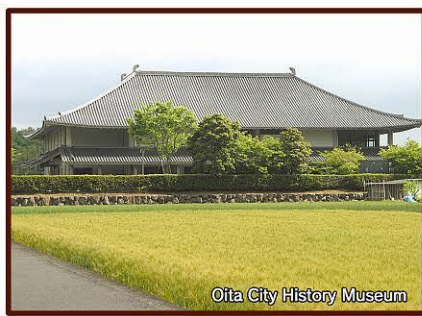
Oita City History Museum