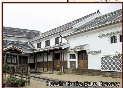
Hoashi Honke Sake Brewery

The level route lets you enjoy Ohno River and the streets of Hetsugi Honmachi. After riding through the pleasant rural landscape and along Ohno River, take a break at Hoashi Honke Sake Brewery and feel the ceaseless passage of time.