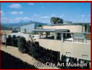
Oita City Art Museum