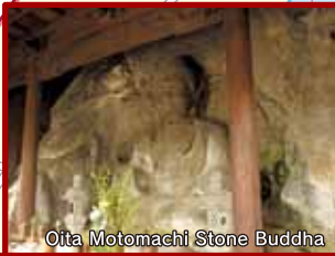
Oita Motomachi Stone Buddha