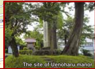
The site of Uenoharu manor