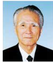
MURAYAMA Tomiichi (Deceased) Politician The 81st Prime Minister Elected as Oita City Honorary Citizen on September 27, 2000