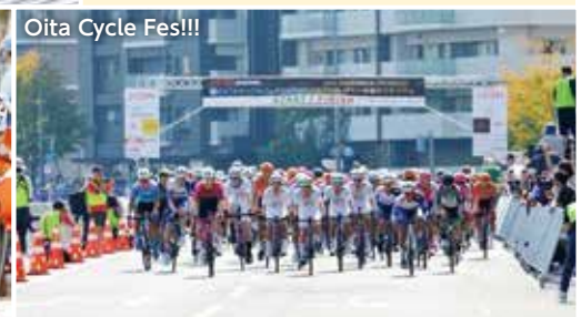
Oita Cycle Fes!!!