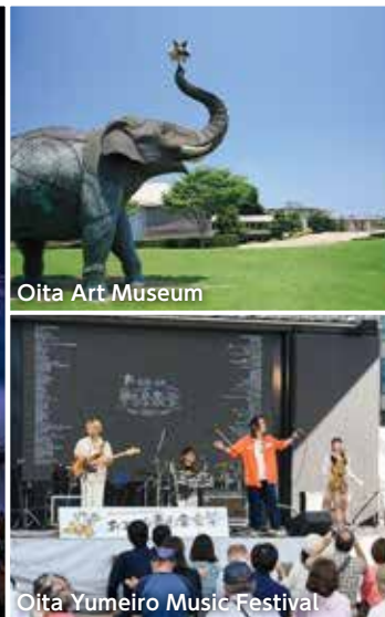
Oita Yumeiro Music Festival