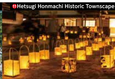
11 Hetsugi Honmachi Historic Townscape