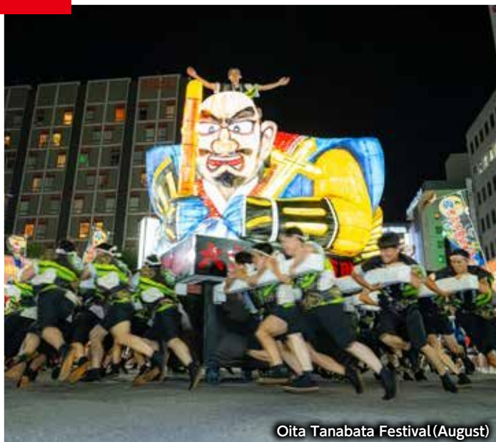
Oita Tanabata Festival (August)

Vibrant Festivals and Regional Traditions