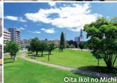
Oita Iko no Michi