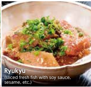
Ryukyu (sliced fresh fish with soy sauce, sesame, etc.)