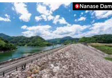
9 Nanase Dam