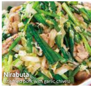
Nirabuta (stir-fried pork with garlic chives)