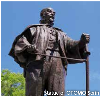
Statue of OTOMO Sorin