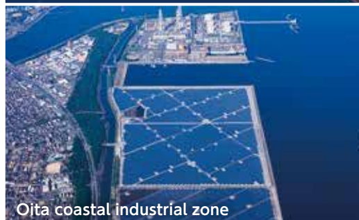
Oita coastal industrial zone