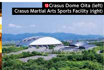
12 Crasus Dome Oita (left) Crasus Martial Arts Sports Facility (right)