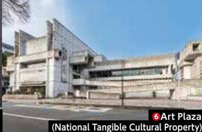
6 Art Plaza (National Tangible Cultural Property)