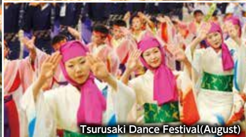
Tsurusaki Dance Festival (August)