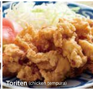
Toriten (chicken tempura)