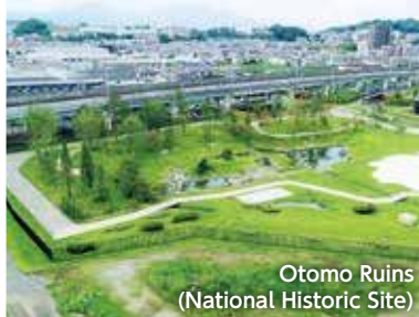
Otomo Ruins (National Historic Site)