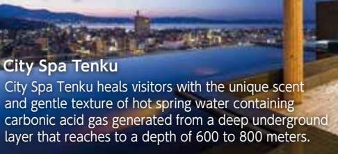
City Spa Tenku

Ultra-deep geothermal hot spring – Healing waters of Oita City's best known hot spring