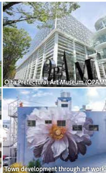
Town development through art work