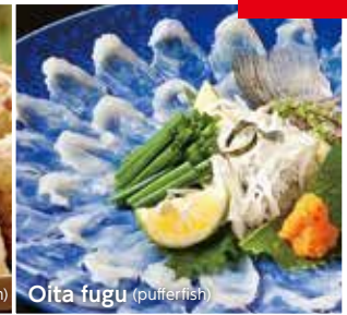
Oita fugu (pufferfish)