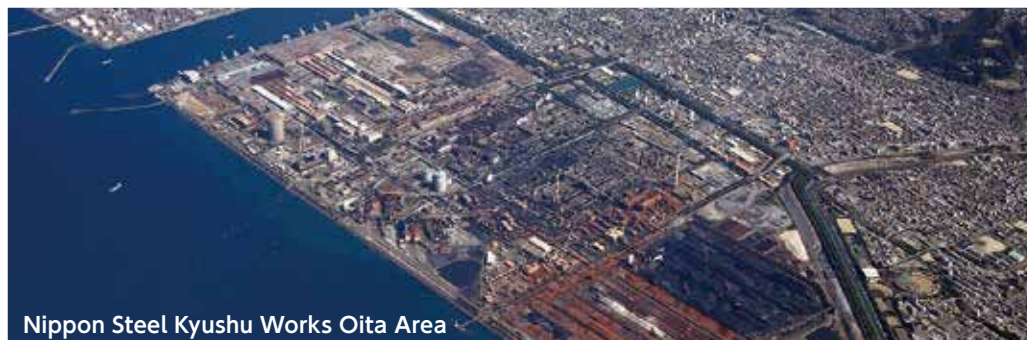
Nippon Steel Kyushu Works Oita Area

Handling a broad range of economic development, from fundamental materials to the digital industry Urban development toward the realization of a sustainable decarbonized society and a recycling-based society