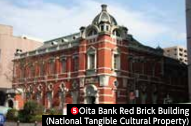
5 Oita Bank Red Brick Building (National Tangible Cultural Property)