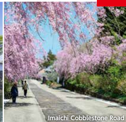
Imaichi Cobblestone Road