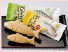
Seki-aji and Seki-saba Monaka Rice wafer filled with bean jam