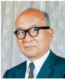
UEDA Tamotsu (Deceased) Lawyer and Politician The first elected mayor of Oita Elected as Oita City Honorary Citizen on March 8, 1963