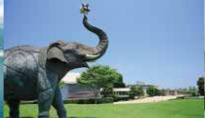
4 Oita Art Museum