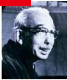
FUKUDA Heihachiro (Deceased) Japanese-style painter Order of Culture and Person of Cultural Merit recipient Elected as Oita City Honorary Citizen on December 19, 1961