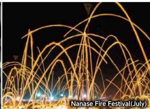
Nanase Fire Festival (July)