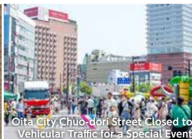
Oita City Chuo-dori Street Closed to Vehicular Traffic for a Special Event