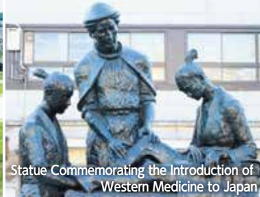
Statue Commemorating the Introduction of Western Medicine to Japan