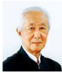
ISOZAKI Arata (Deceased) Architectural Institute of Japan Award (1967, 1975) RIBA Gold Medal (1986) Venice Biennale's Golden Lion Award(1996) Pritzker Prize (2019) Elected as Oita City Honorary Citizen on July 16, 2019

Trace the origins and history of Namban culture, the unique fusion of European and Japanese influences that evolved over time.