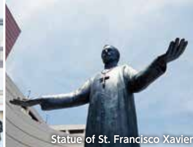
Statue of St. Francisco Xavier