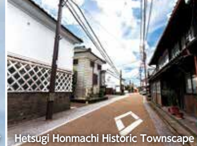
Hetsugi Honmachi Historic Townscape