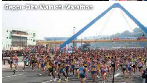
Beppu-Oita Mainichi Marathon