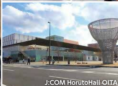
J:COM HorutoHall OITA