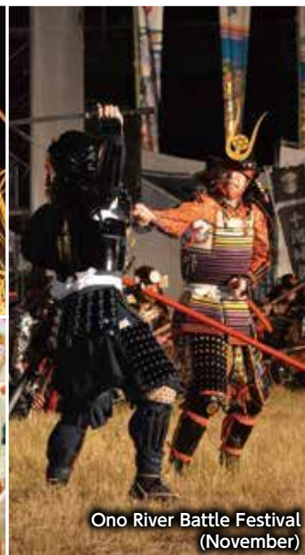
Ono River Battle Festival (November)