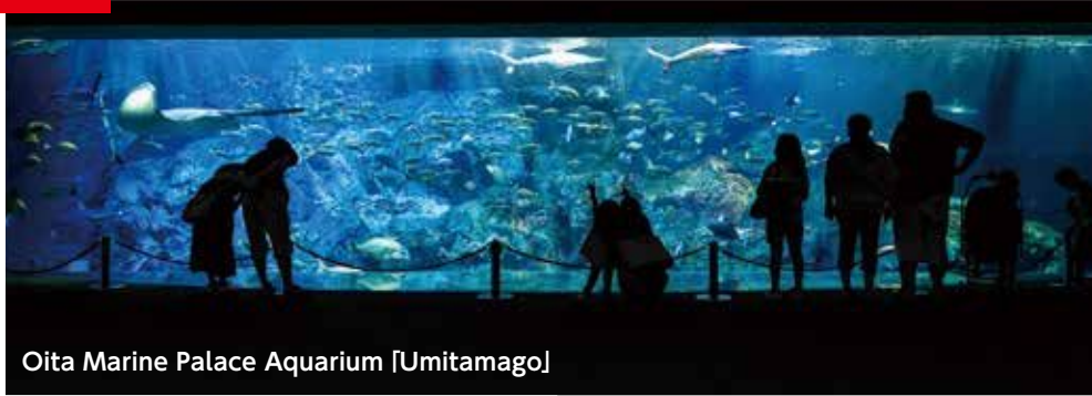
Oita Marine Palace Aquarium [Umitamago]

Promising visitors an experience filled with beauty, charm, wonder, excitement and unforgettable hospitality that will make them yearn to return to Oita again!