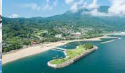
3 Tanoura Beach