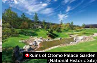
7 Ruins of Otomo Palace Garden (National Historic Site)