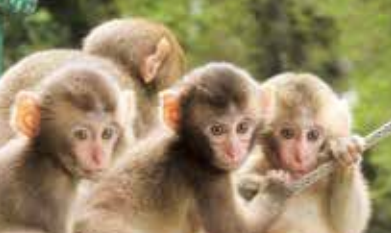
1 Takasakiyama Natural Zoological Garden