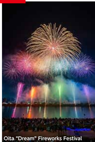
Oita "Dream" Fireworks Festival

Excitement shared by everyone regardless of country, region, generation, and gender