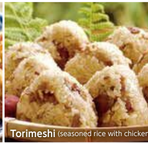
Torimeshi (seasoned rice with chicken)