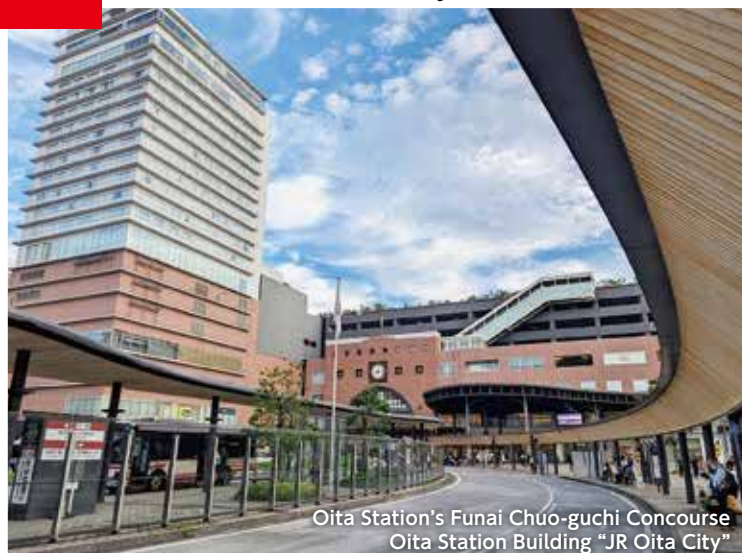
Oita Station's Funai Chūo-guchi Concourse Oita Station Building "JR Oita City"

Vibrant and comfortable places where people gather