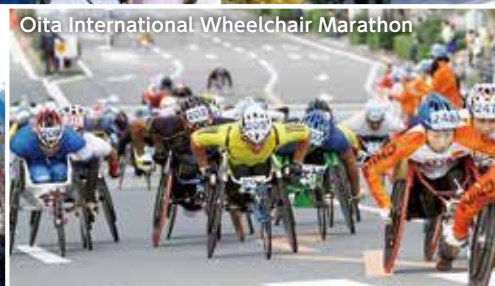
Oita International Wheelchair Marathon