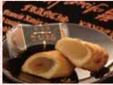
Zabieru Dough filled with white sweet bean paste