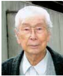
TAKAYAMA Tatsuo (Deceased) Japanese-style painter Order of Culture and Person of Cultural Merit recipient Elected as Oita City Honorary Citizen on January 10, 1983