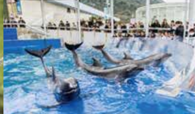
2 Oita Marine Palace Aquarium Umitamago