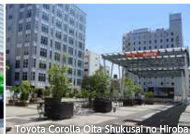
Toyota Corolla Oita Shukusai no Hiroba