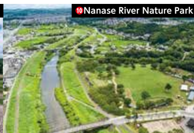
10 Nanase River Nature Park