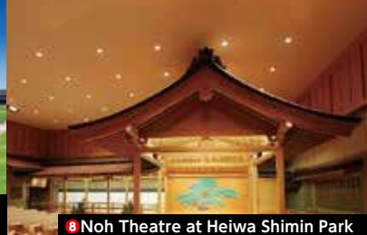
8 Noh Theatre at Heiwa Shimin Park