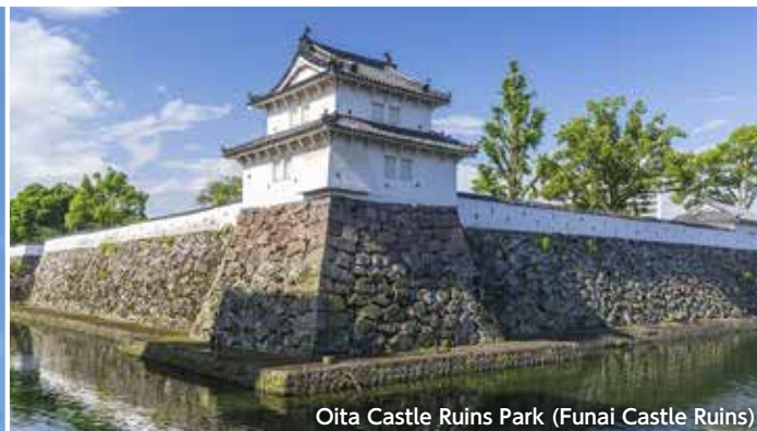
Oita Castle Ruins Park (Funai Castle Ruins)