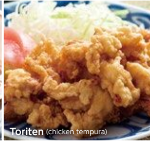
Toriten (chicken tempura)