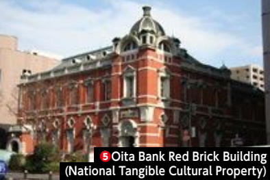
5 Oita Bank Red Brick Building (National Tangible Cultural Property)