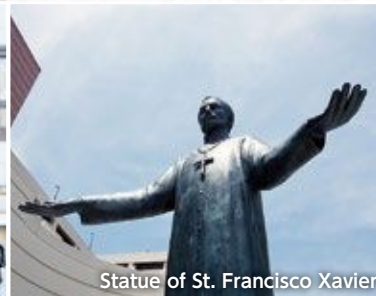
Statue of St. Francisco Xavier