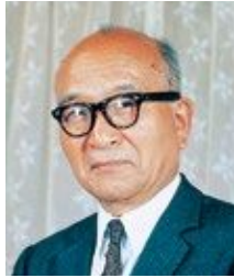
UEDA Tamotsu (Deceased) Lawyer and Politician The first elected mayor of Oita Elected as Oita City Honorary Citizen on March 8, 1963