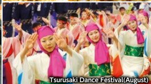
Tsurusaki Dance Festival (August)