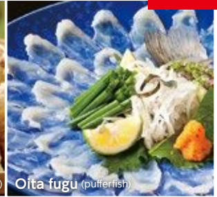
Oita fugu (pufferfish)