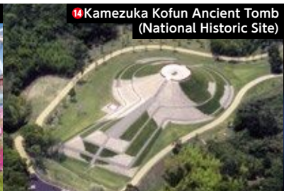
14 Kamezuka Kofun Ancient Tomb (National Historic Site)