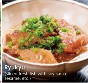
Ryukyu (sliced fresh fish with soy sauce, sesame, etc.)