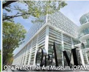
Oita Prefectural Art Museum (OPAM)