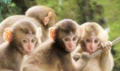
1 Takasakiyama Natural Zoological Garden