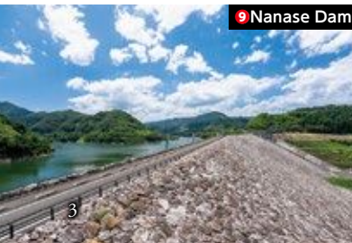
9 Nanase Dam