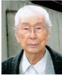
TAKAYAMA Tatsuo (Deceased) Japanese-style painter Order of Culture and Person of Cultural Merit recipient Elected as Oita City Honorary Citizen on January 10, 1983