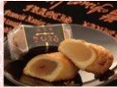
Zabieru Dough filled with white sweet bean paste