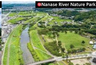
10 Nanase River Nature Park