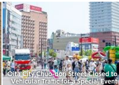
Oita City Chuo-dori Street Closed to Vehicular Traffic for a Special Event