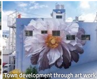
Town development through art work