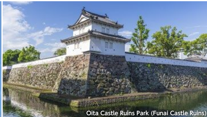
Oita Castle Ruins Park (Funai Castle Ruins)