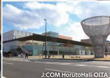
J:COM HorutoHall OITA