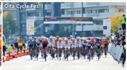
Oita Cycle Fes!!!