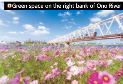
13 Green space on the right bank of Ono River