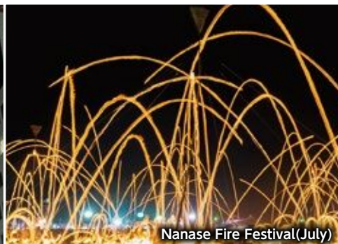
Nanase Fire Festival (July)