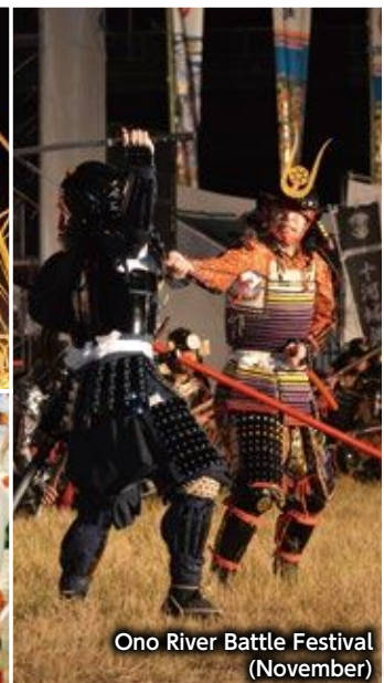
Ono River Battle Festival (November)