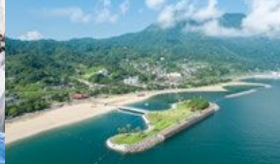
3 Tanoura Beach