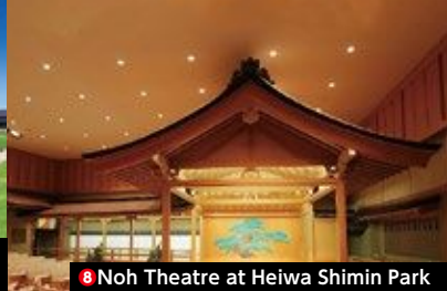
8 Noh Theatre at Heiwa Shimin Park