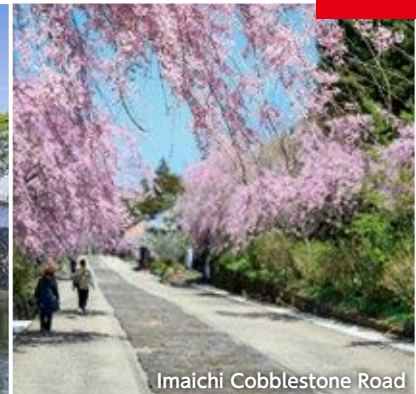
Imaichi Cobblestone Road