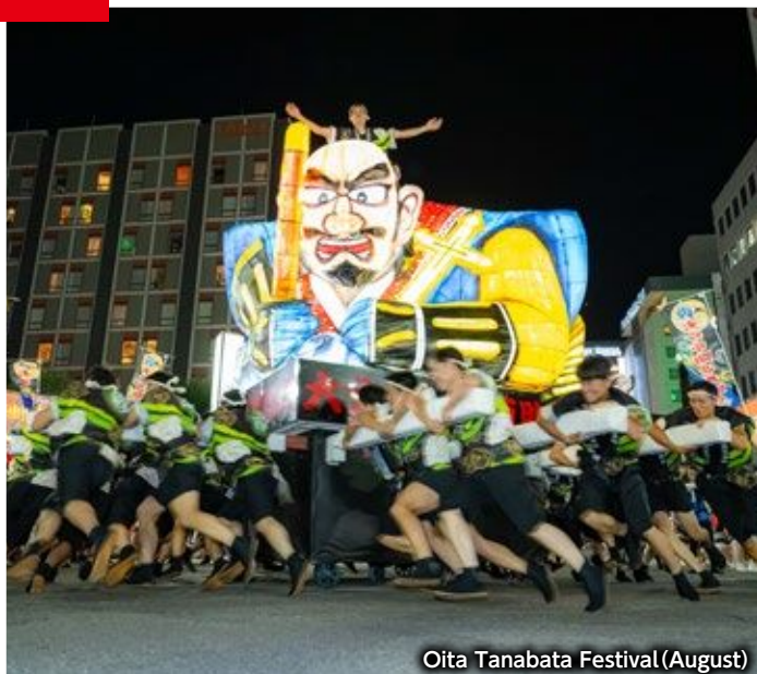
Oita Tanabata Festival (August)

Vibrant Festivals and Regional Traditions