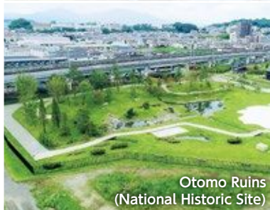
Otomo Ruins (National Historic Site)