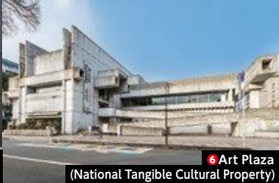
6 Art Plaza (National Tangible Cultural Property)