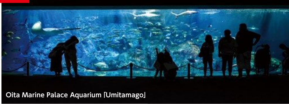
Oita Marine Palace Aquarium [Umitamago]

Promising visitors an experience filled with beauty, charm, wonder, excitement and unforgettable hospitality that will make them yearn to return to Oita again!