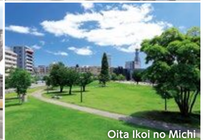
Oita Ikoi no Michi