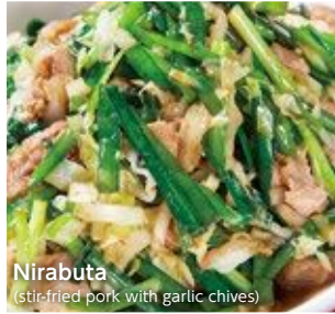
Nirabuta (stir-fried pork with garlic chives)

Delicious food made with the blessings of Oita's land and sea