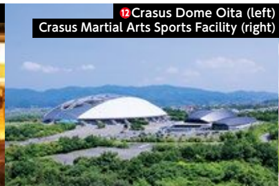
12 Crasus Dome Oita (left) Crasus Martial Arts Sports Facility (right)