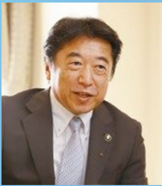
ADACHI Shinya Mayor of Oita