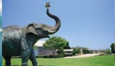
4 Oita Art Museum