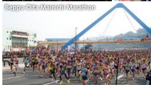
Beppu-Oita Mainichi Marathon