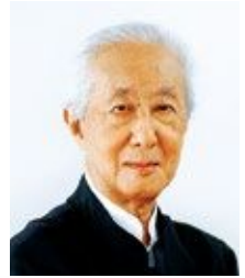
ISOZAKI Arata (Deceased) Architectural Institute of Japan Award (1967, 1975) RIBA Gold Medal (1986) Venice Biennale's Golden Lion Award(1996) Pritzker Prize (2019) Elected as Oita City Honorary Citizen on July 16, 2019

Trace the origins and history of Namban culture, the unique fusion of European and Japanese influences that evolved over time.