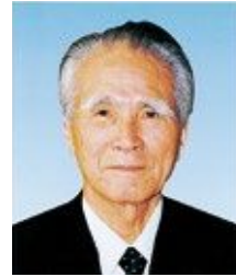
MURAYAMA Tomiichi Politician The 81st Prime Minister Elected as Oita City Honorary Citizen on September 27, 2000