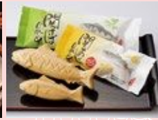
Seki-aji and Seki-saba Monaka Rice wafer filled with bean jam