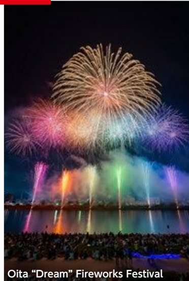
Oita "Dream" Fireworks Festival

Excitement shared by everyone regardless of country, region, generation, and gender