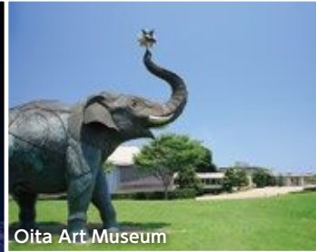
Oita Art Museum