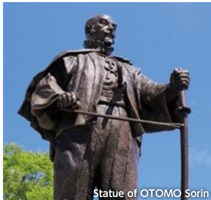
Statue of OTOMO Sorin