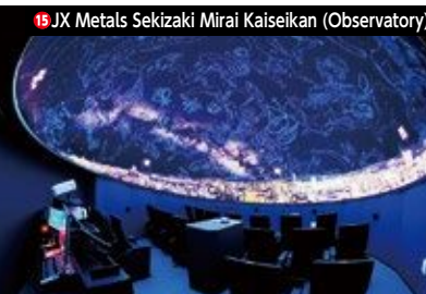
15 JX Metals Sekizaki Mirai Kaiseikan (Observatory)