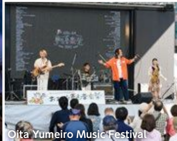
Oita Yumeiro Music Festival