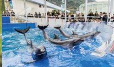
2 Oita Marine Palace Aquarium Umitamago