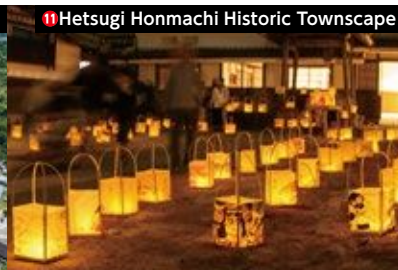
11 Hetsugi Honmachi Historic Townscape