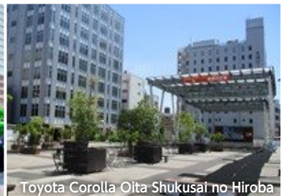
Toyota Corolla Oita Shukusai no Hiroba