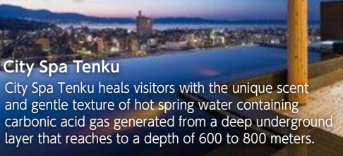
City Spa Tenku

Ultra-deep geothermal hot spring - Healing waters of Oita City's best known hot spring