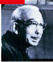
FUKUDA Heihachiro (Deceased) Japanese-style painter Order of Culture and Person of Cultural Merit recipient Elected as Oita City Honorary Citizen on December 19, 1961