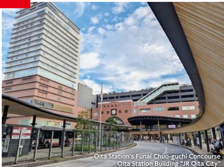
Oita Station's Funai Chuo-guchi Concourse Oita Station Building "JR Oita City"

Vibrant and comfortable places where people gather