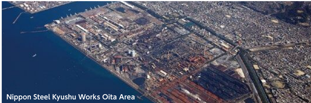
Nippon Steel Kyushu Works Oita Area

Handling a broad range of economic development, from fundamental materials to the digital industry Urban development toward the realization of a sustainable decarbonized society and a recycling-based society