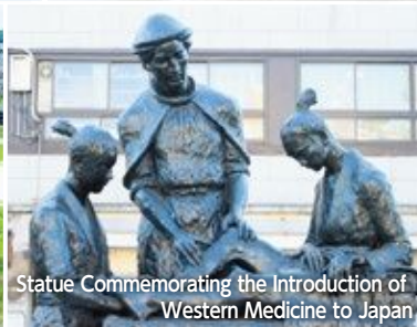
Statue Commemorating the Introduction of Western Medicine to Japan