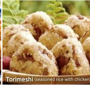
Torimeshi (seasoned rice with chicken)