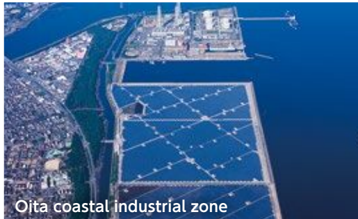
Oita coastal industrial zone