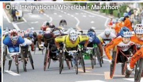
Oita International Wheelchair Marathon