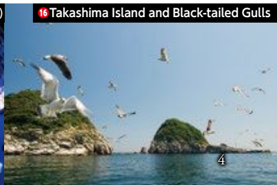
16 Takashima Island and Black-tailed Gulls