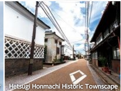
Hetsugi Honmachi Historic Townscape