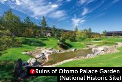
7 Ruins of Otomo Palace Garden (National Historic Site)